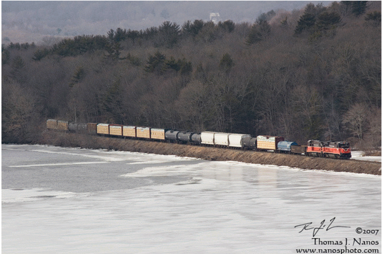
Windham, Connecticut. Providence & Worcester train MFS-5 pulls along the Shetucket River above the Scotland Dam. All twenty cars are showing.