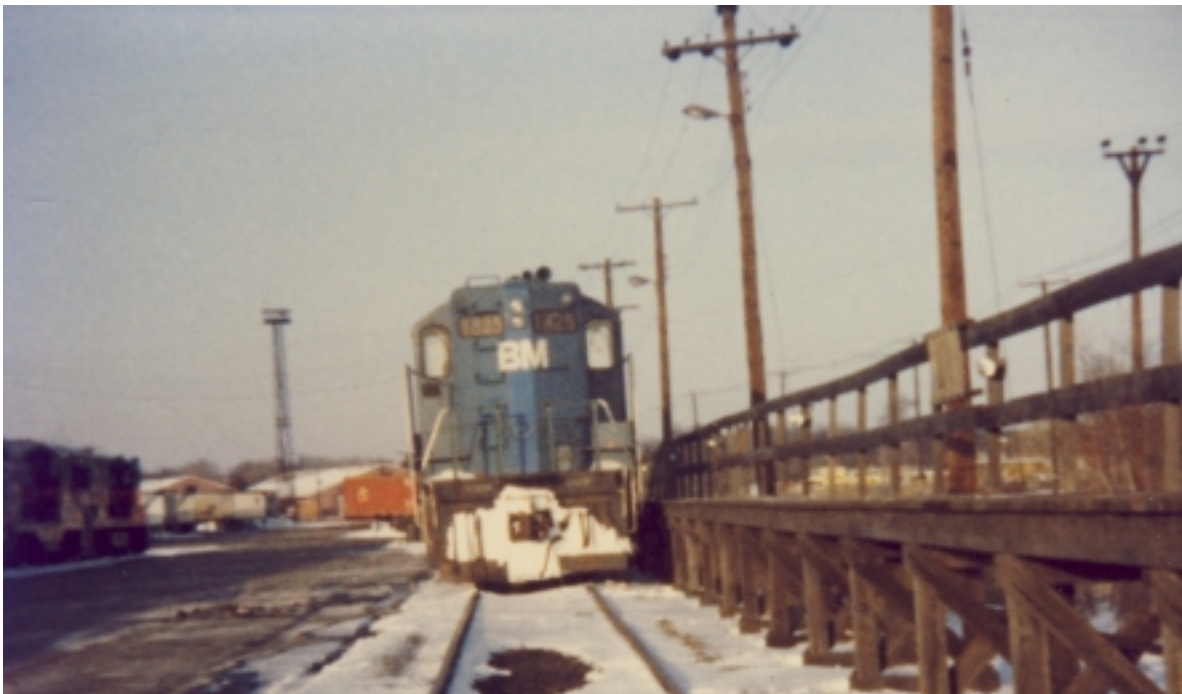
Cedar Hill, North Haven Connecticut. In 1983, B&M operated intermodal service into New Haven. The 1983 photo shows B&M locomotive 1825, and in the shadow on the left, the East Wind business train.