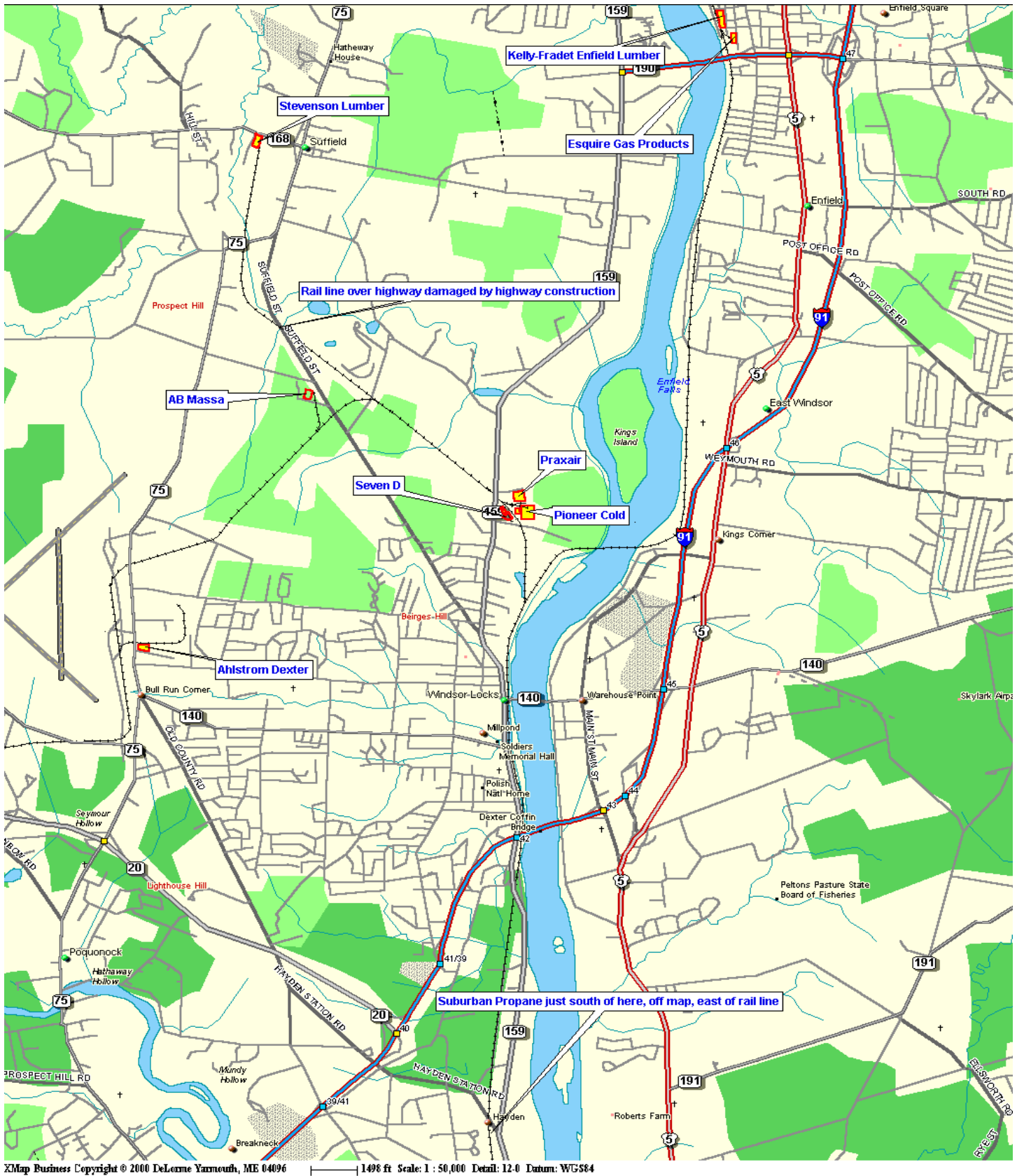
Windsor Locks (center), Suffield (upper left) and Enfield (upper right) Connecticut. The map shows CSO rail customers on Amtrak’s Northeast Corridor running along the west side of the Connecticut River then crossing it, and on the Suffield Industrial Track, diverging from the NEC just above Windsor Locks and curving back to Bradley Airport. CSO owns the line from the NEC to Suffield, while the state owns the part into the airport. The location of the damaged rail bridge is shown.