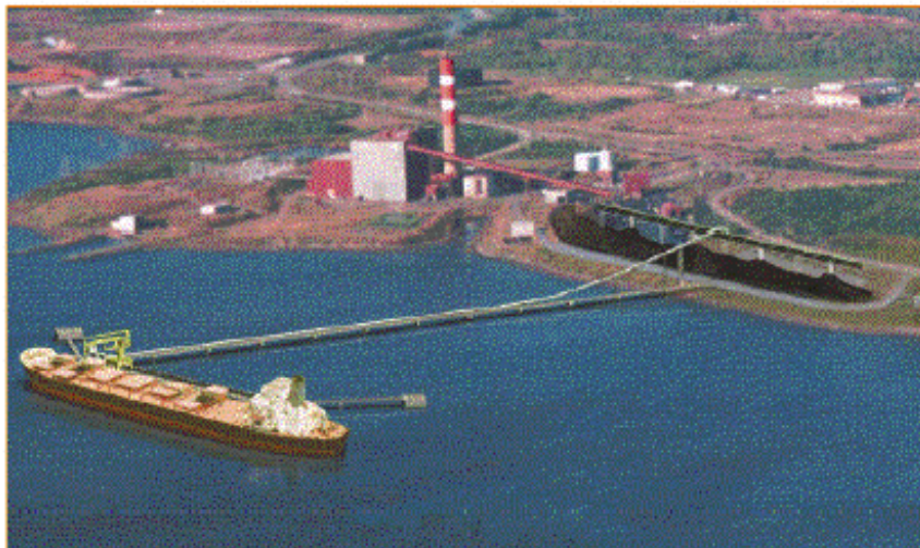
Figure 3 - Marine Terminal Artists Rendering (Rendering may differ slightly from Figure 2)

Some have suggested that NSP build a 900-megawatt circulating fluidized bed combustion generating station next to the new terminal and the existing Point Tupper plant. {Wes Steward in Cape Breton Post 19.Aug.04}